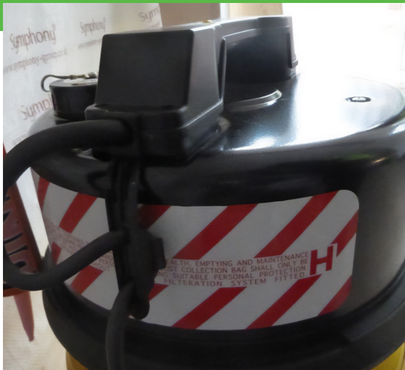
Picture illustrates H class vacuum for use with on-tool extraction and for cleaning up.