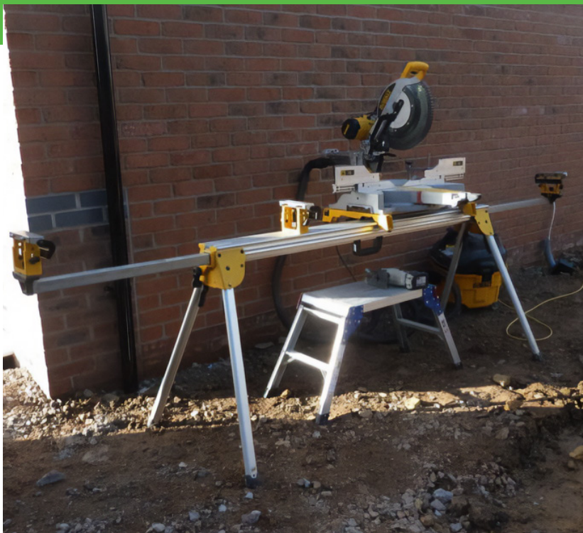
Picture illustrates chop saw fitted with dust extraction.